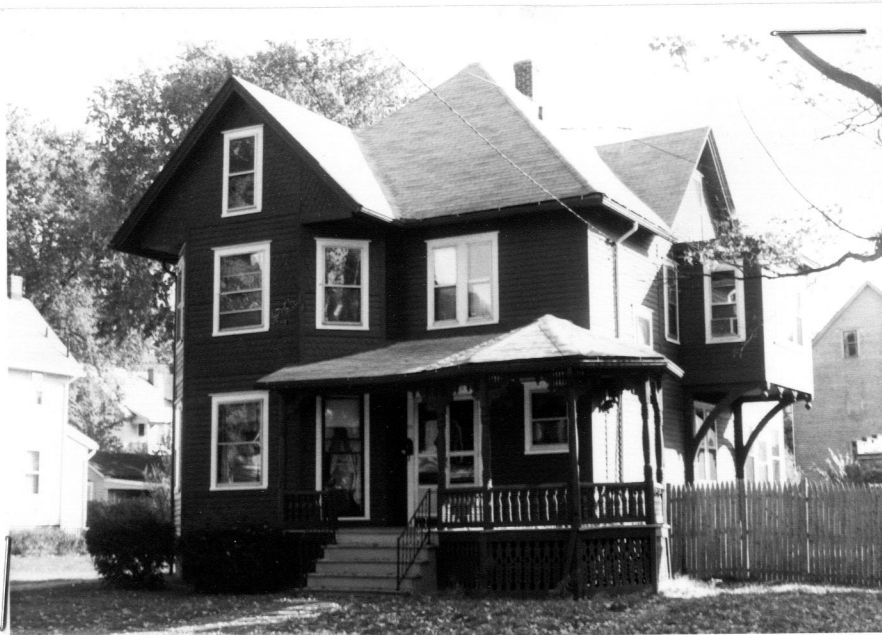
Rollz. 29 Arlington st