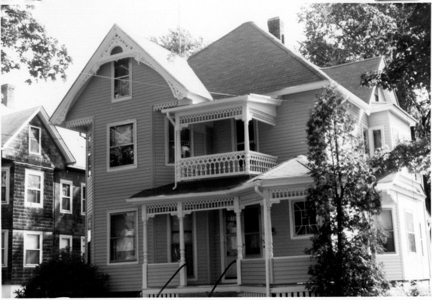
35 ARLINGTON ST

15 ARLINGTON ST. #3 21 " " #566 29 " " #567 35 " " #568